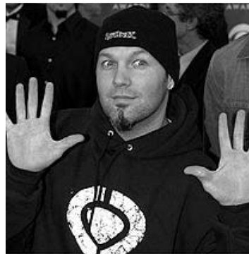
He uses humor. "I didn't do it."