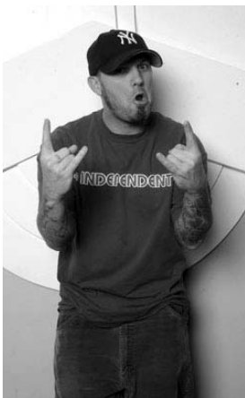
Whoa! Attitude upon request.